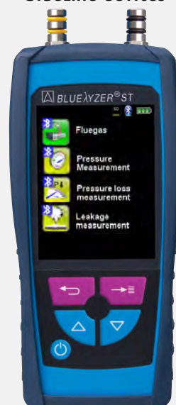
Example on our BLUELYZER ® ST