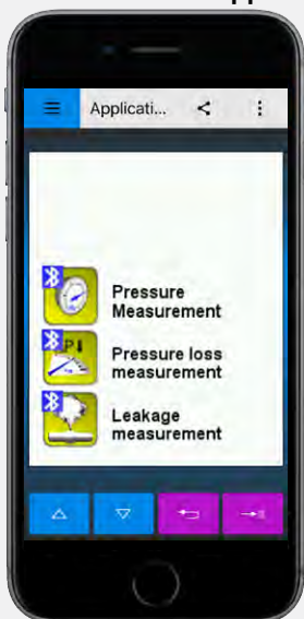
Example on your Smartphone